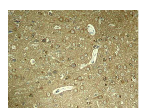
Immunohistochemical analysis of paraffin-embedded rat hippocampal region tissue from a model with Alzheimer's Disease using Tau (phospho-Ser404) antibody (#11112).